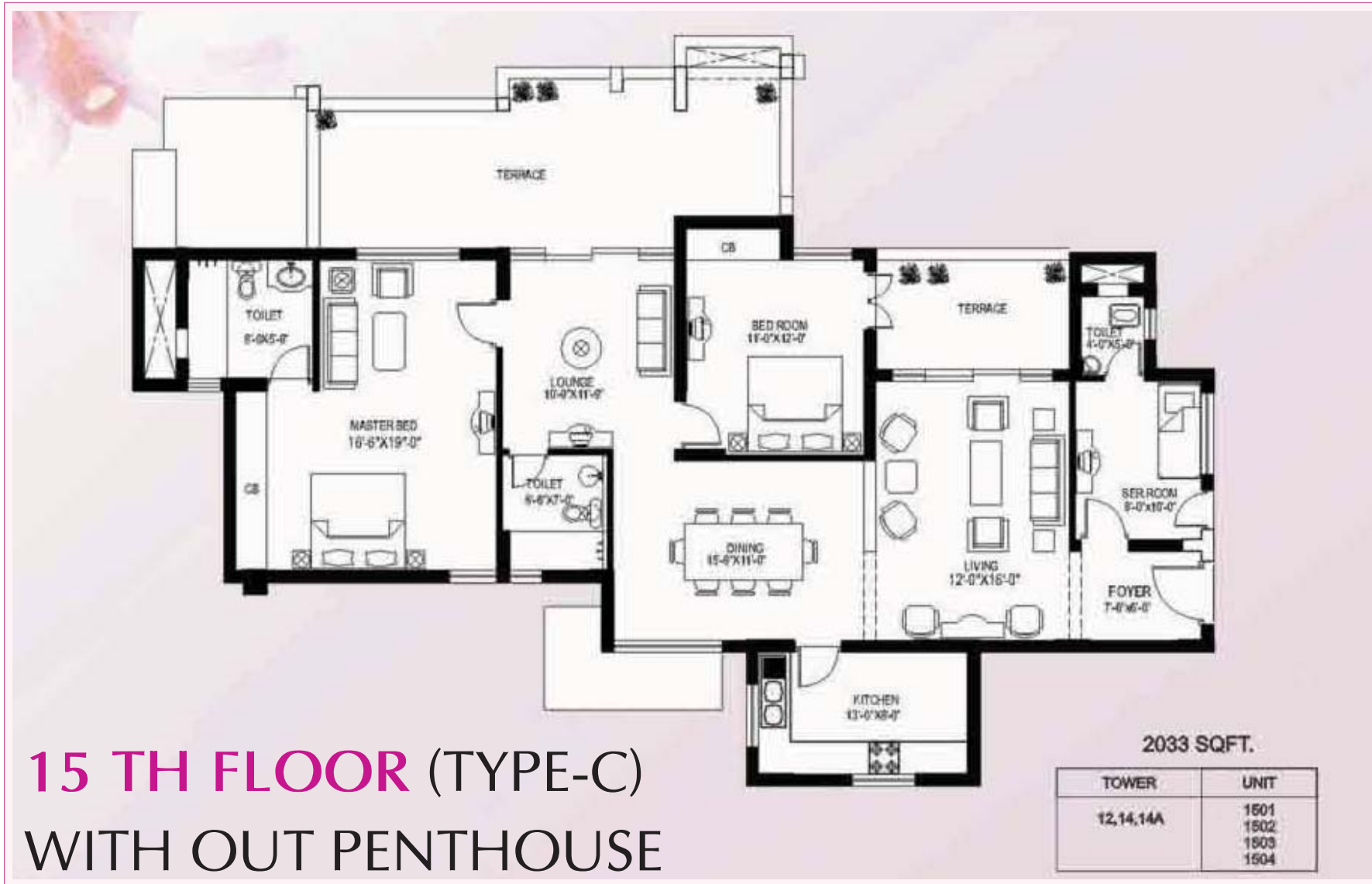
15 TH FLOOR (TYPE-C) WITH OUT PENTHOUSE