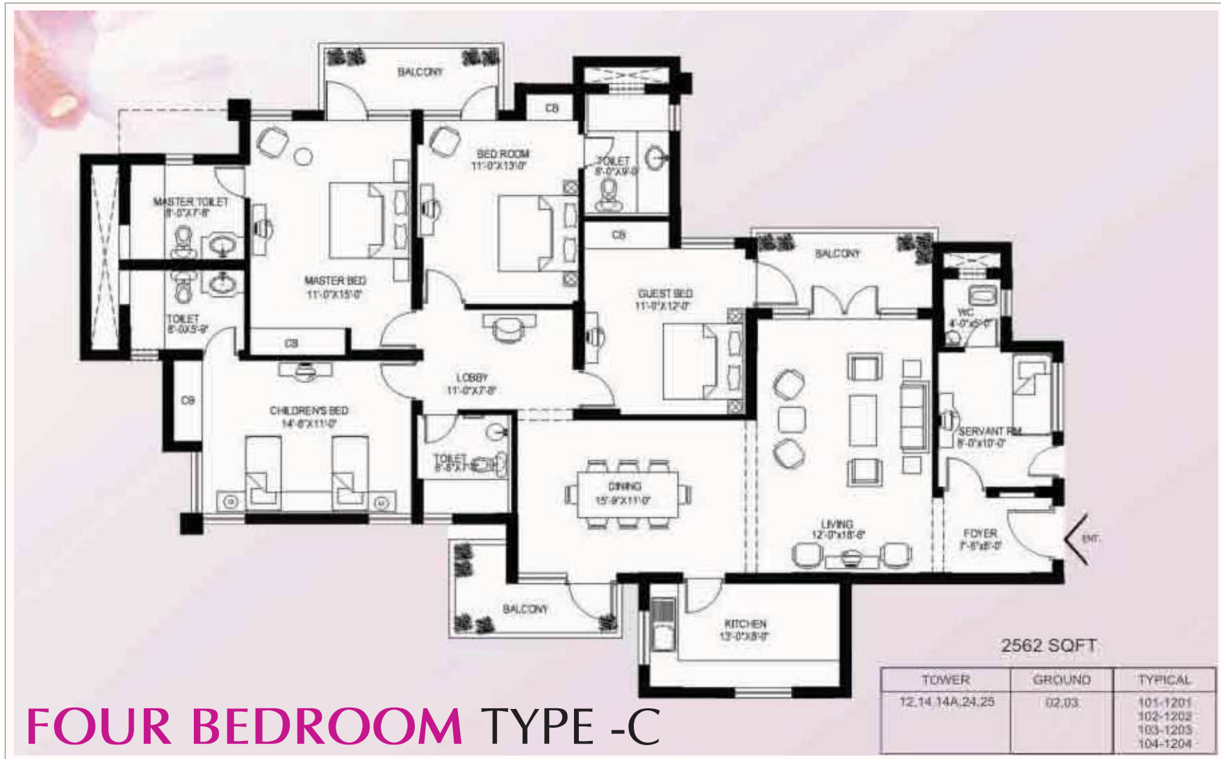
FOUR BEDROOM TYPE -C